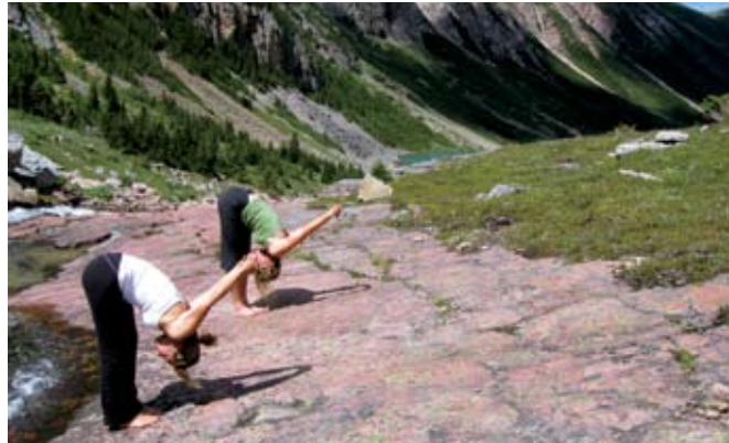
Heli-yoga (above) takes your poses to entirely new heights. Mountain Escape at Lake Louise Inn (right) is a women's retreat with a 30-year history.

LOCATION Icefield Helicopter Tours has its heliport base at Cline River in the Rockies, on the David Thompson Highway, two hours from Banff. Helicopters fly up the Cline River valley and drop guests on the north and east alpine meadow slopes of Mt. Cline.