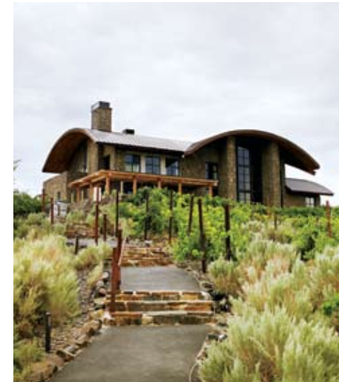
Cozy up in your own private casita at Cave B Inn at Sagecliffe near Quincy, Washington.

PACKAGE This three-day Yoga Weekend (from $625, based on double occupancy) offers a little something extra: food and wine, including tastings with Sagecliffe Winery's winemaker and a cooking class with chef Shauna Scriver. The