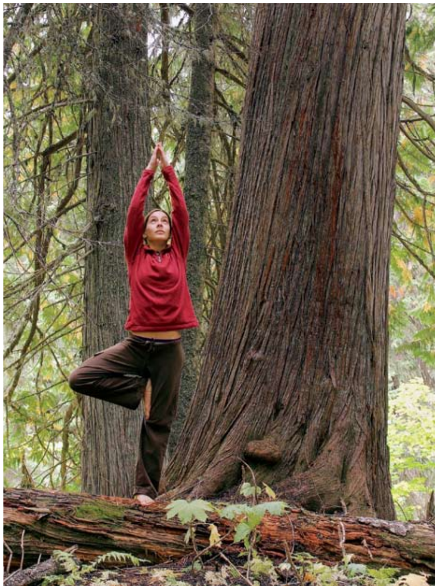
Island Lake Lodge makes the most of its mountain setting near Fernie, B.C., to host luxe mountain yoga, couples' wellness and spa getaway packages that include hiking, eco-tours and log-cabin lodgings.

COOL PERK You tailor your package to be as outdoorsy and active, or as quiet and zen-trospective, as your heart desires.— C.D.